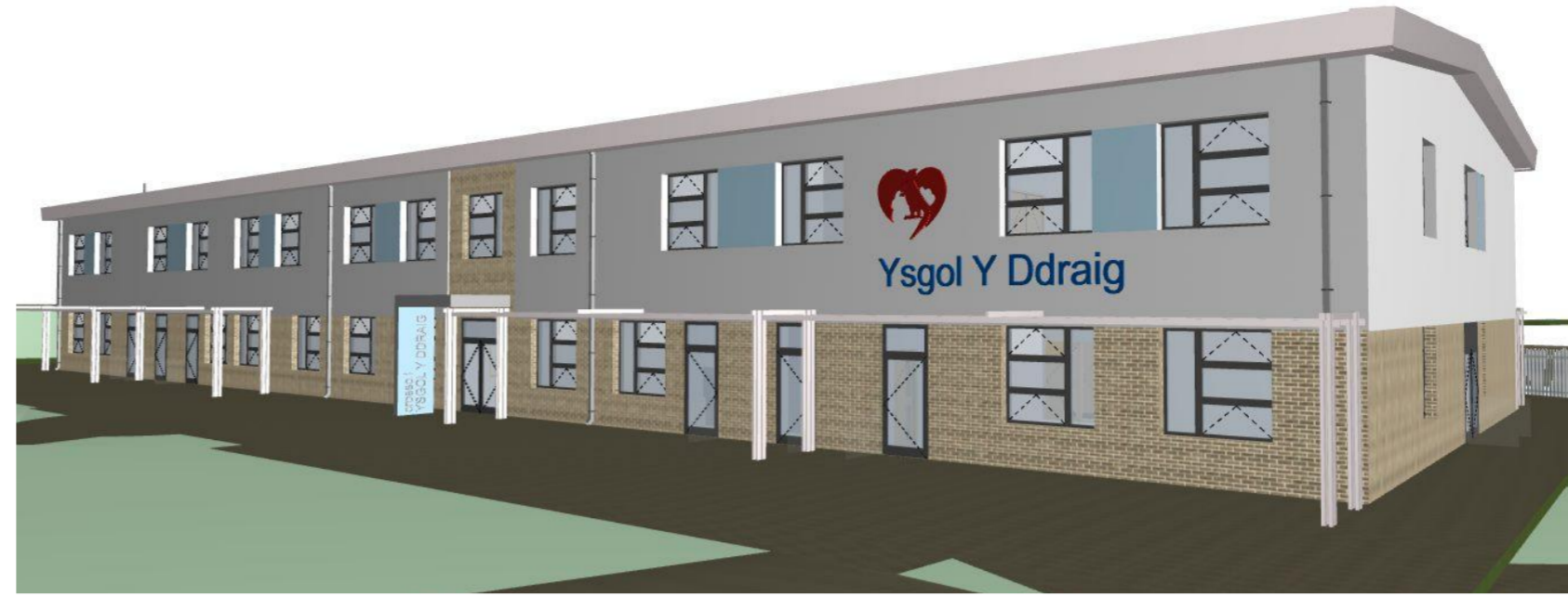
Ext 02 Entrance Approach