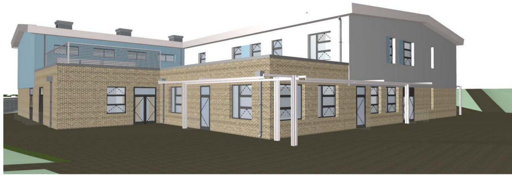
Ext 05 Nursery Corner