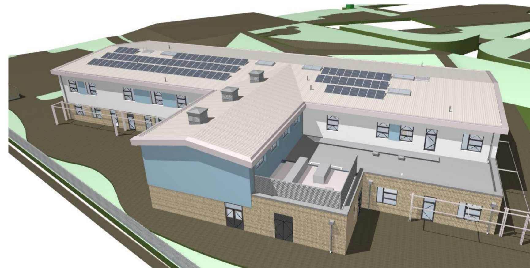
Ext 07 Aerial View from rear