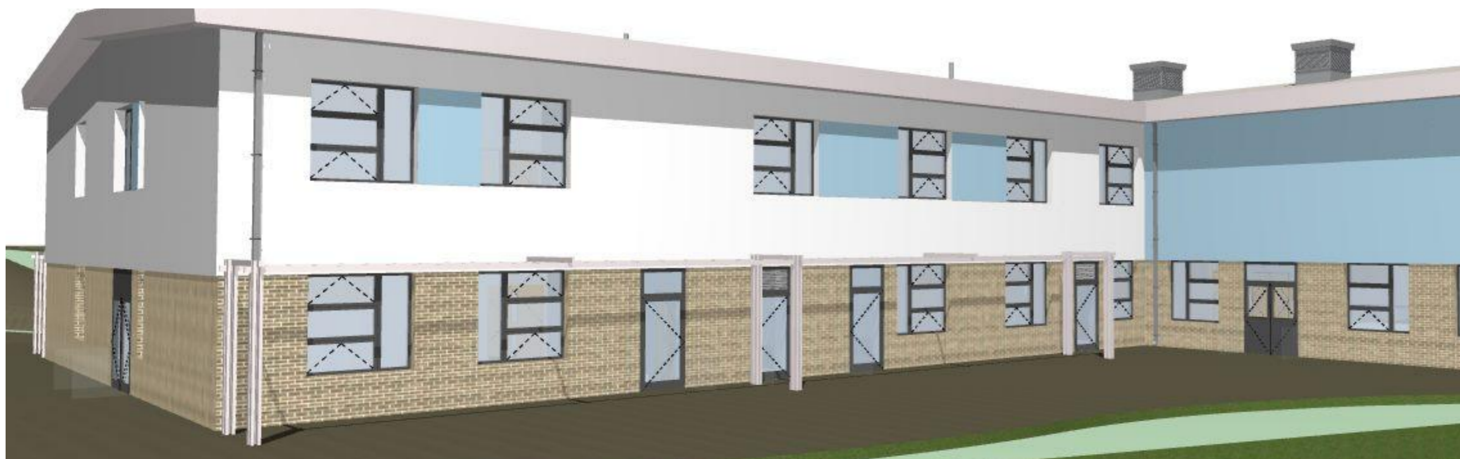
Ext 06 Rear Hall View