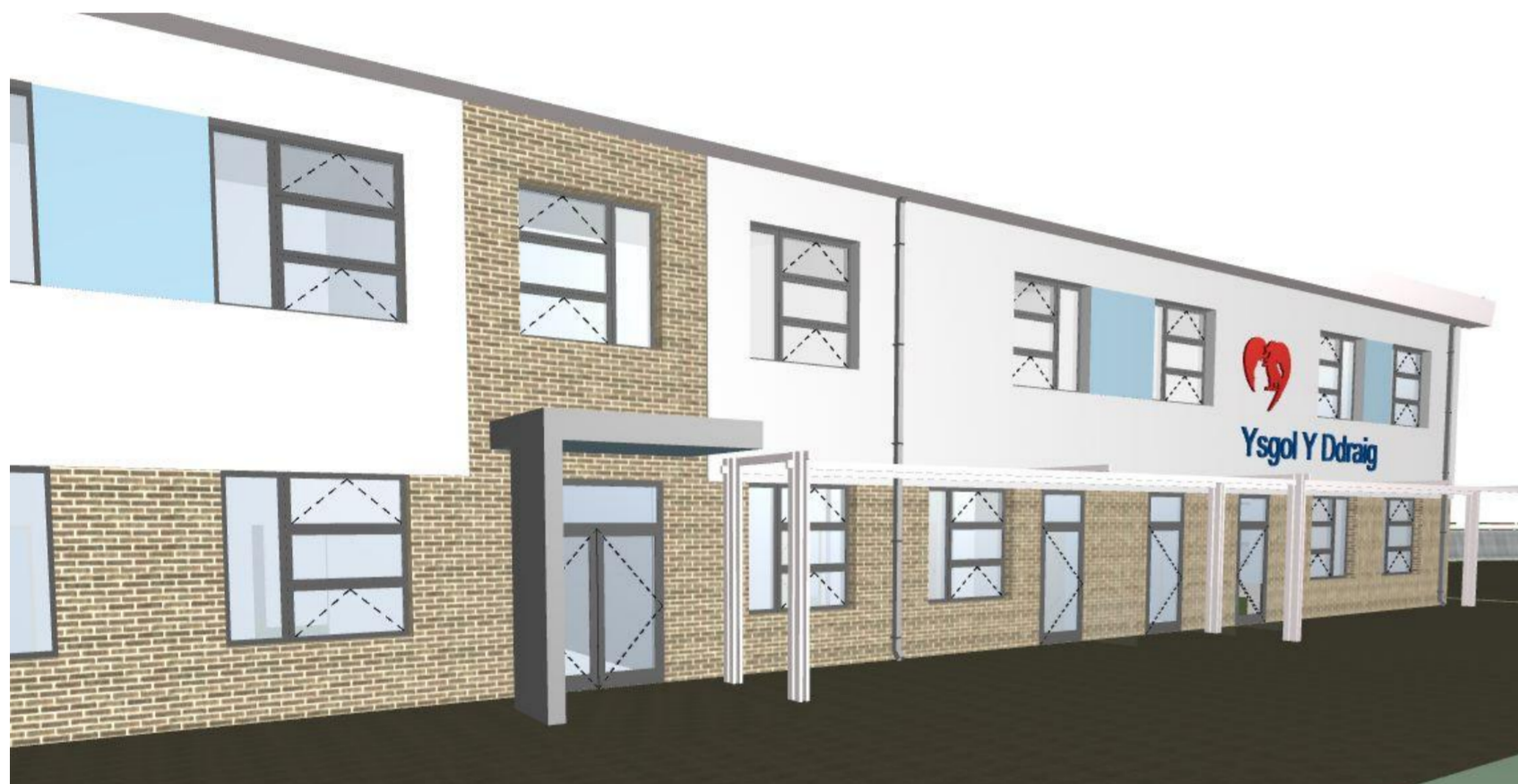
Ext 04 View from Amphitheatre