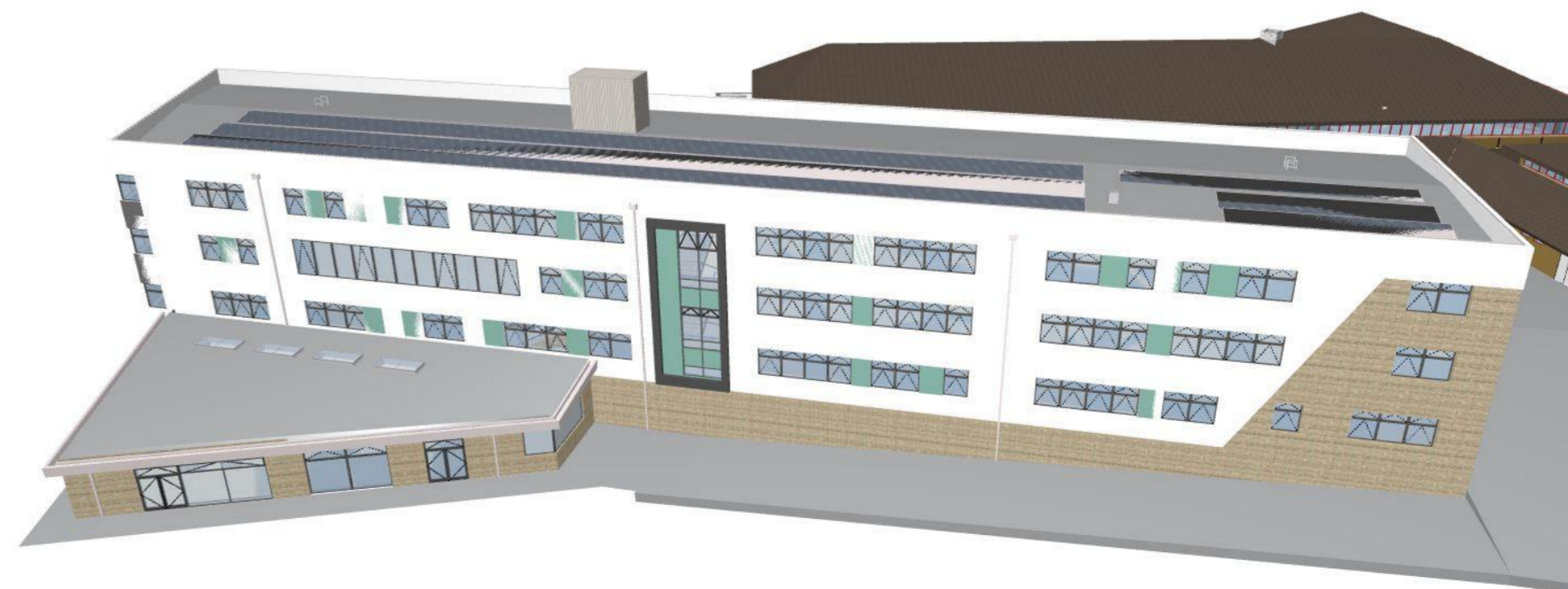
Ext 6 Aerial View From Sports Facilities