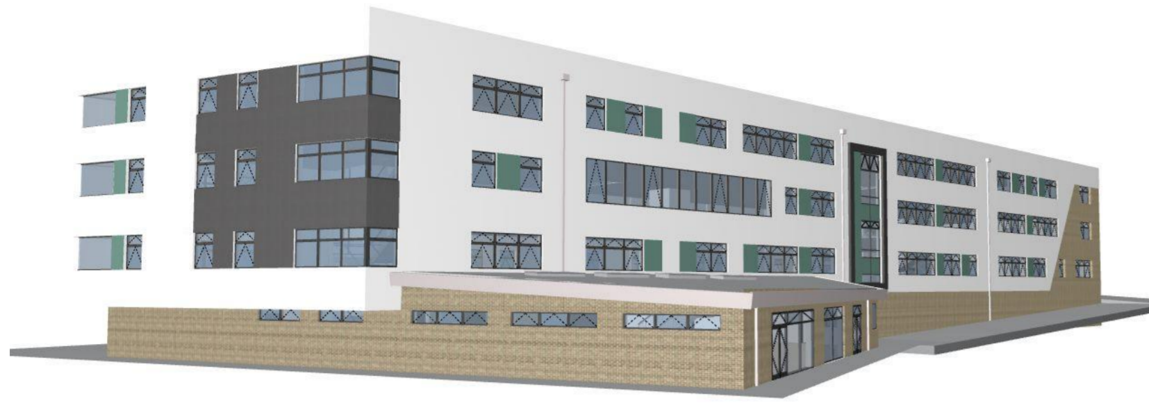
Ext 01 View From Primary School Site