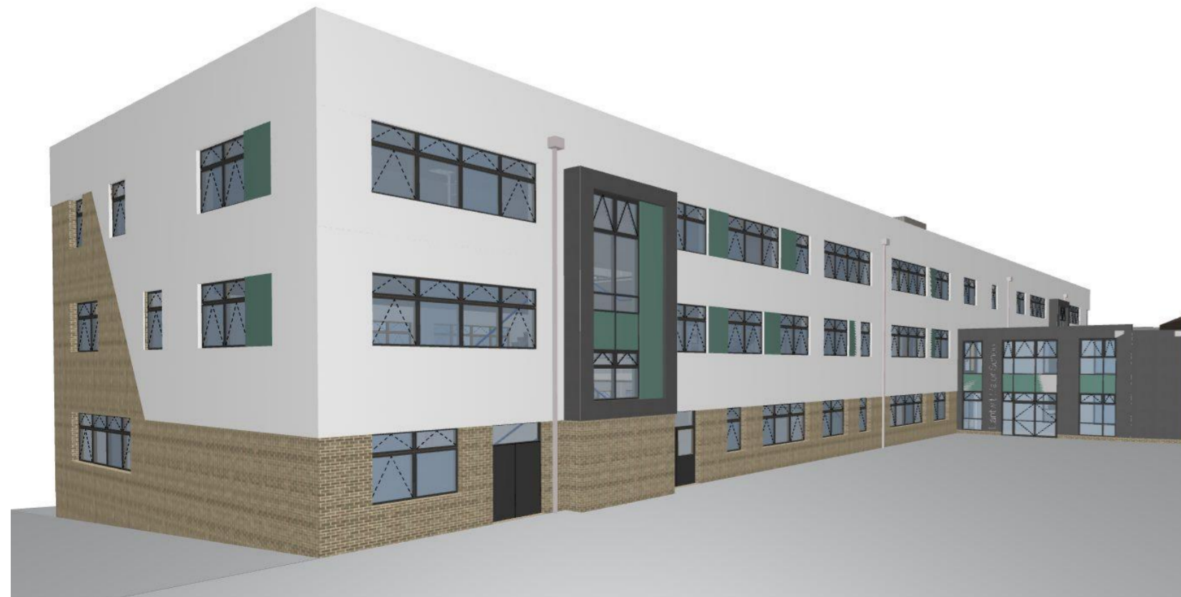
Ext 5 View From Existing Block M