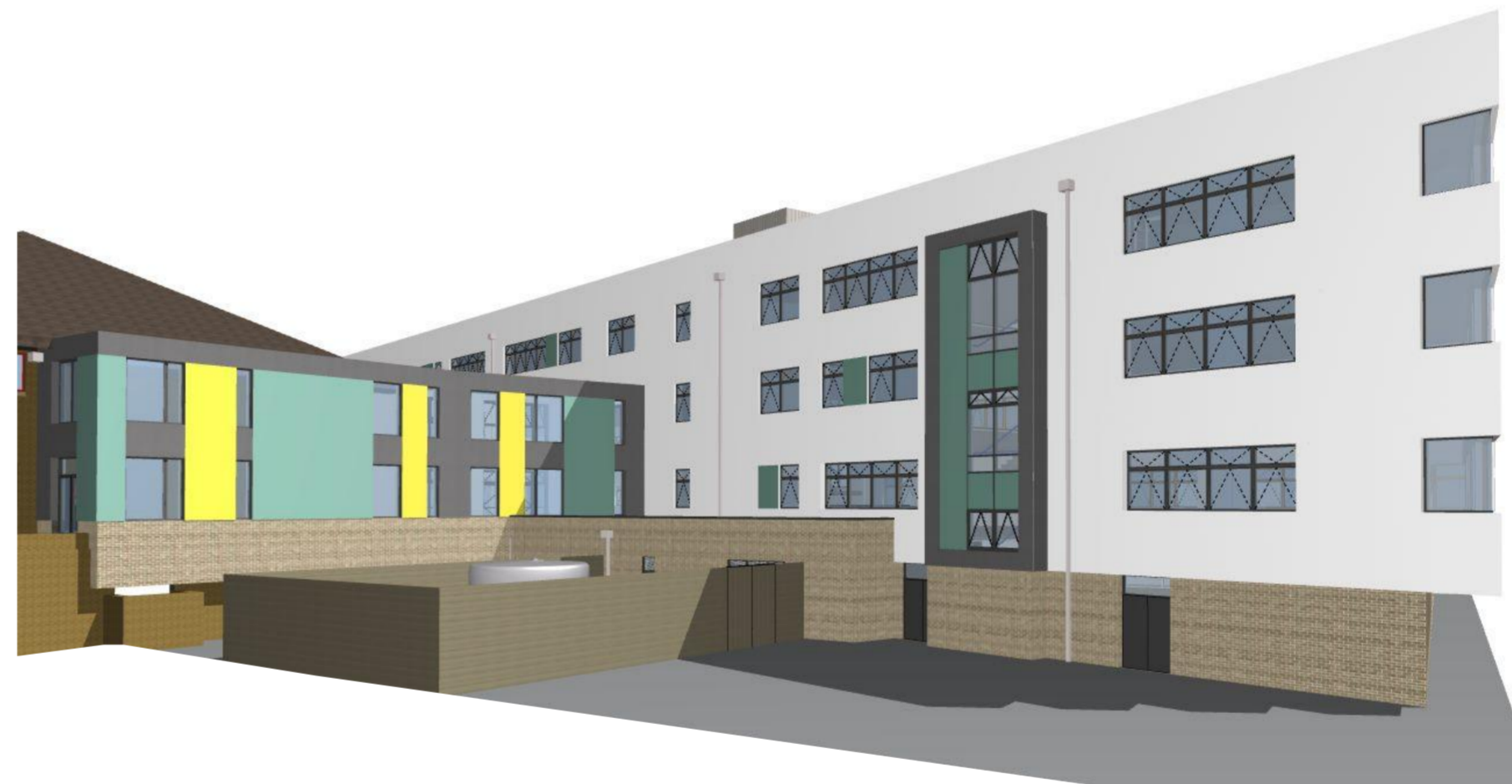
Ext 4 View From Ham Lane East