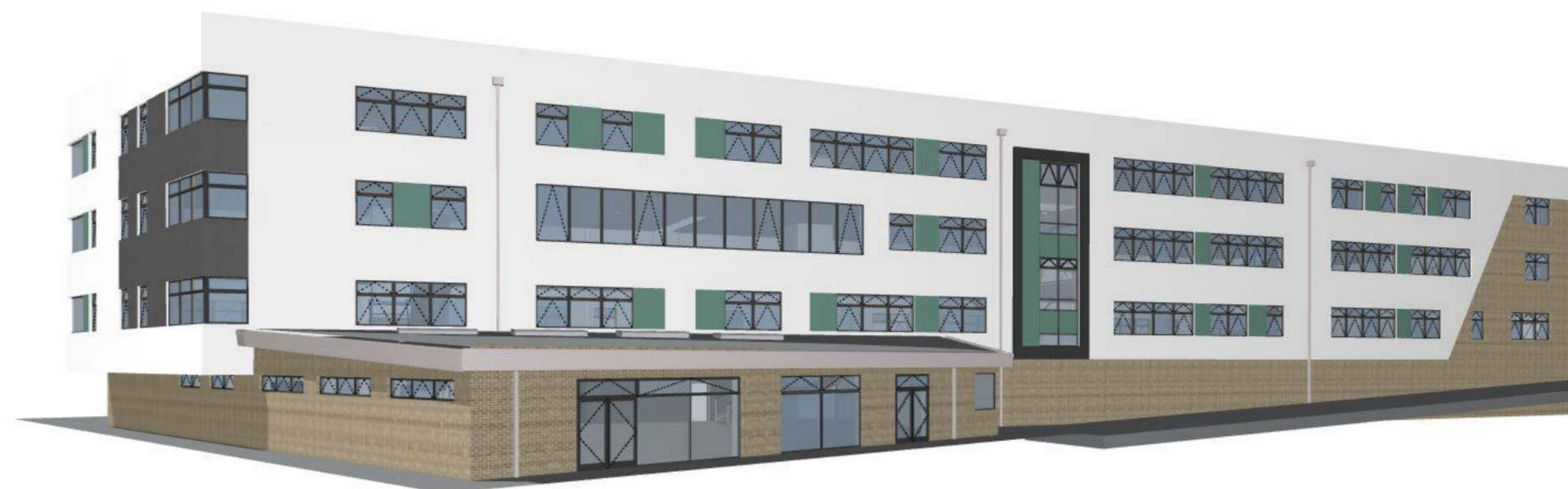
Ext 02 View to Dining Area