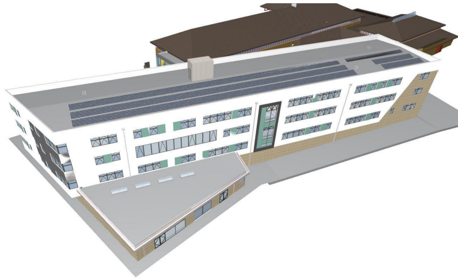
Ext 03 Aerial View From Primary School